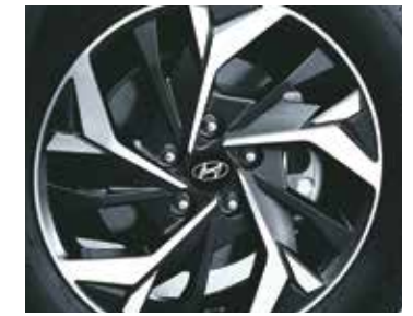
All wheel disc brakes