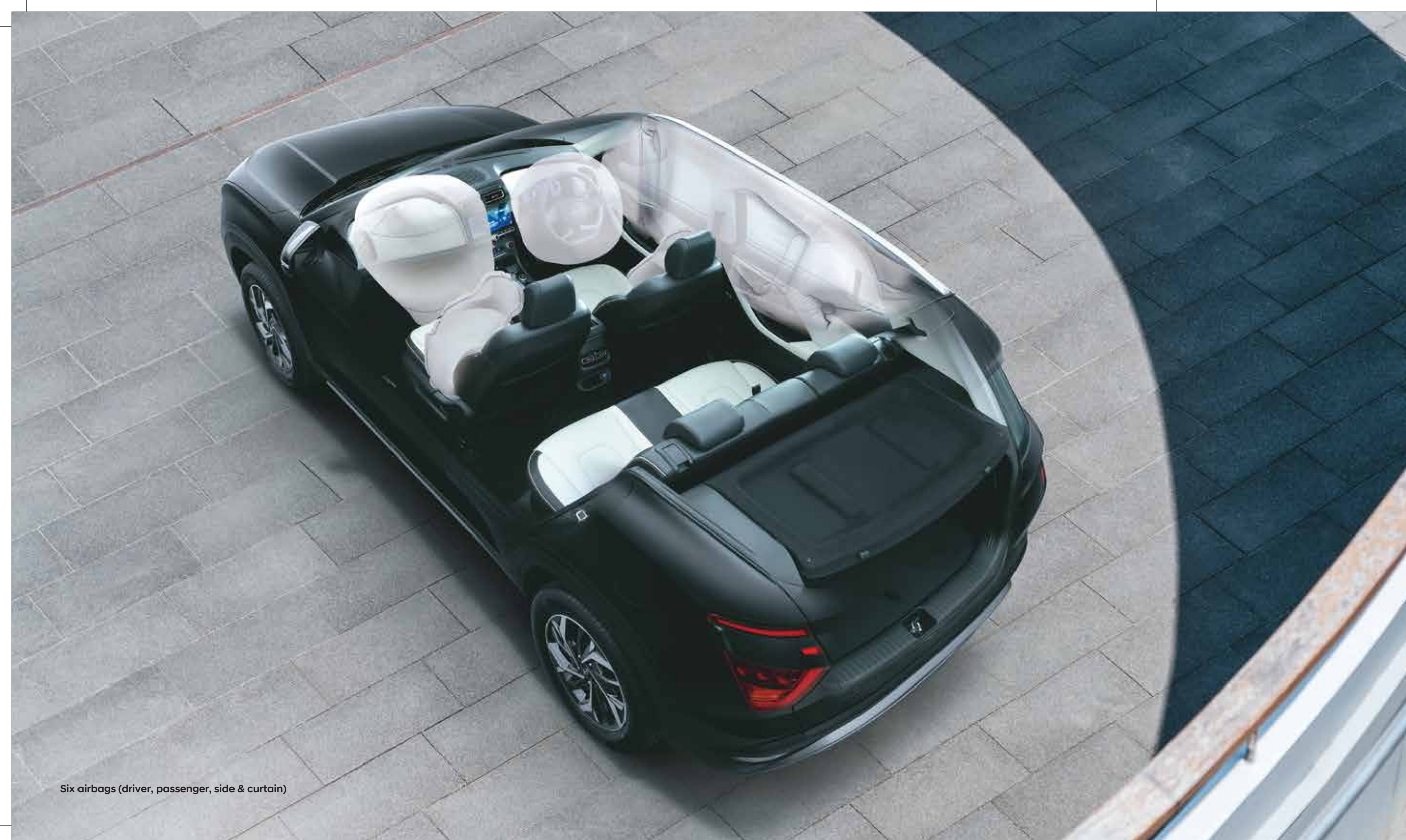
Six airbags (driver, passenger, side & curtain)