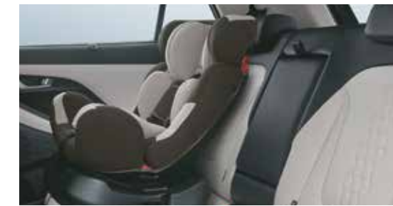
Child seat anchor (ISOFIX)