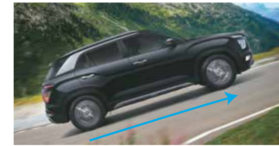
Hill start assist control (HAC)