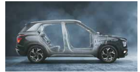
Strong body structure with AHSS