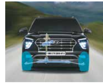
Vehicle stability management (VSM)