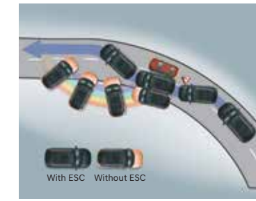
Electronic stability control (ESC)

The strong body structure with redefined standards of safety, ensure a secure drive for you and your family every time you hit the road.