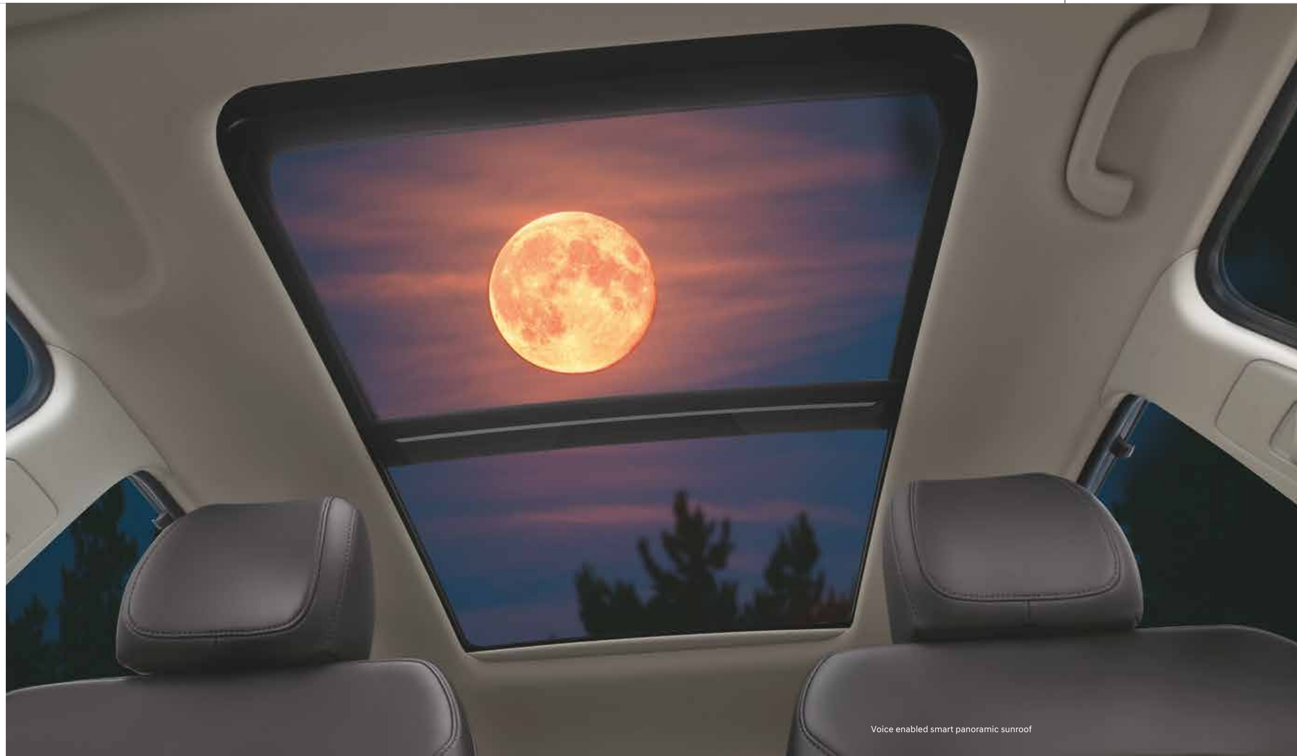
Voice enabled smart panoramic sunroof