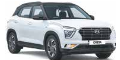
Polar white with phantom black roof