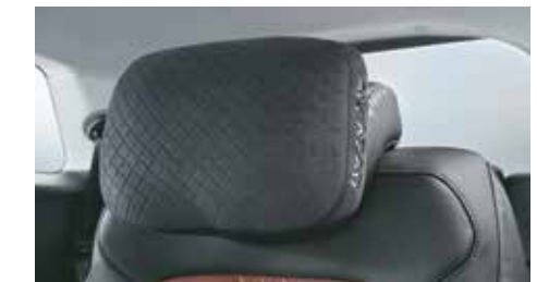
2 nd row headrest cushion