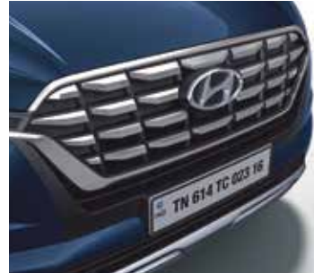
Dark front chrome grille*