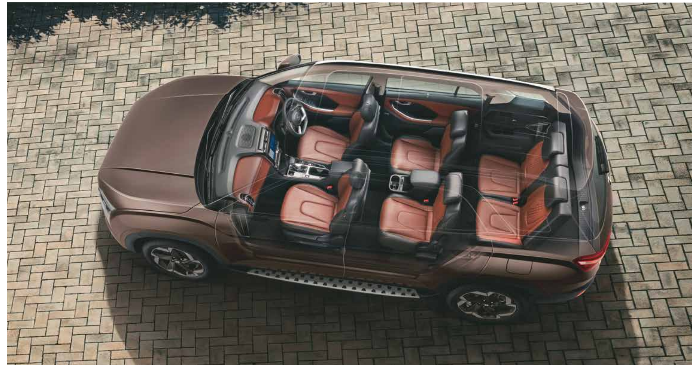
Leather pack: Perforated D-cut steering wheel | Perforated gear knob | Cognac brown and black seat upholstery | Door armrest

The interior of the Hyundai ALCAZAR immerses you in uncluttered design. Complete with premium dual tone cognac brown interiors, the 64 colours ambient lighting offers a regal touch to the cabin. Carefully selected materials accentuate the aesthetic, complete with Hyundai ALCAZAR's advanced technology, ensuring that your entertainment knows no bounds. Experience serenity thanks to a voice controlled panoramic sunroof and an auto healthy air purifier. The tranquil sanctuary is also outfitted with an HD touchscreen system with powerful Bose premium sound system, immersing you in a rich and balanced premium audio experience.