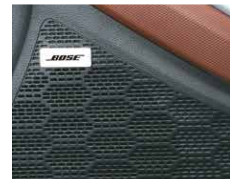
Bose premium sound system (8 speakers)