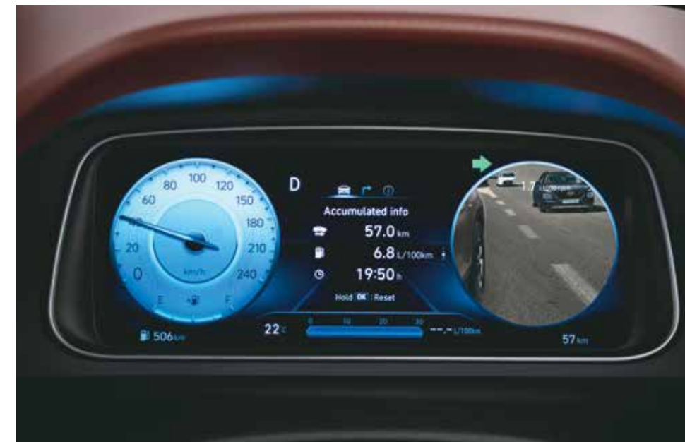
Blind view monitor (BVM)