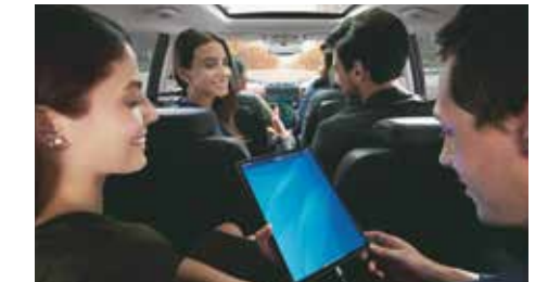
4 USB chargers for 3 rows