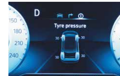
Tyre pressure monitoring system (Highline)