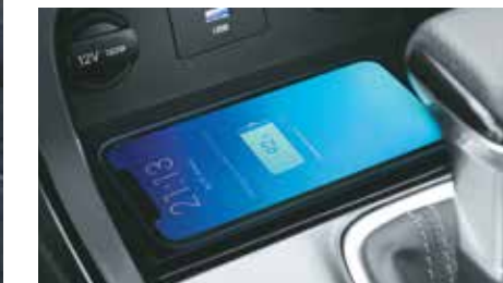
1 st & 2 nd row smartphone wireless charger