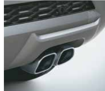
Twin tip exhaust