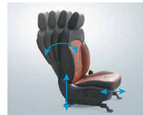
Power driver seat - 8 way