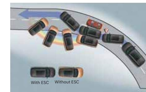
Electronic stability control (ESC)