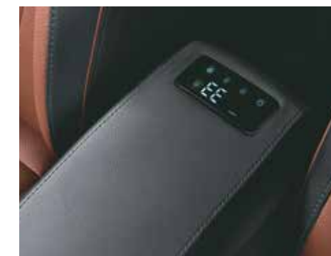
Auto healthy air purifier with AQI display