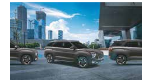
Parking assist: Front and rear parking sensors

Other features: Emergency stop signal | Speed alert system | Speed sensing auto door lock | Driver rear view monitor Impact sensing auto door unlock | Child seat anchor (ISOFIX) | Electric parking brake with auto hold