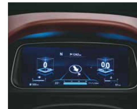
26.03 cm (10.25") Multi display digital cluster with personalized themes