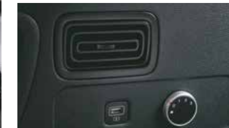
3 rd row AC vents with speed control (3-stage)