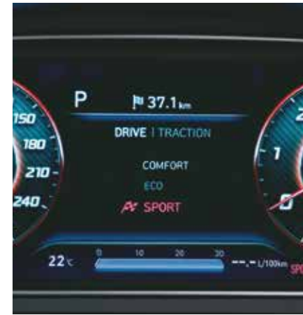
Drive mode select

Other features: Welcome greetings | Voice recognition commands (I want to see the sky / What's the Indian cricket score? / When is the soccer match?) | Bluelink integrated smartwatch app