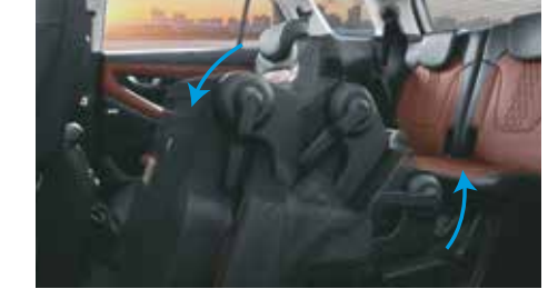
2 nd row - one touch tip tumble captain & split seats