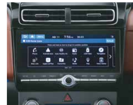
26.03 cm (10.25") HD touchscreen system