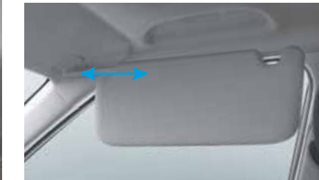
Front row sliding sunvisor