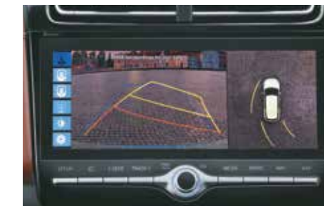
Surround view monitor (SVM)