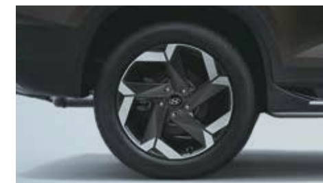
Rear disc brakes