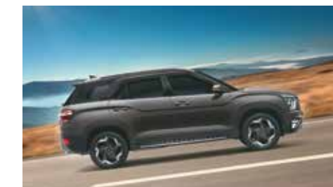
Hill start assist control (HAC)