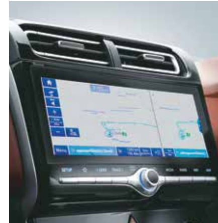
Advanced Bluelink with OTA map updates