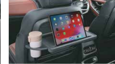
Front row seatback table with retractable cup-holder and IT device holder