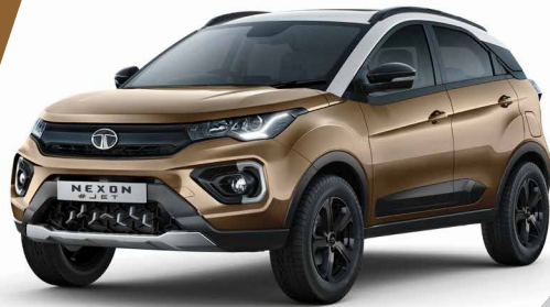
Dual-tone 'Starlight' exterior colour

An exquisite combination of earthy bronze body and a platinum silver roof.