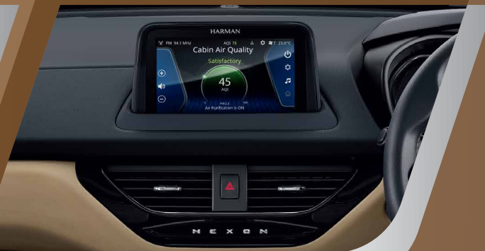
Air Purifier with AQI display

Premium Oyster White Ventilated Leatherette seats with Bronze Deco Stitch and #JET Embroidery on front Headrests