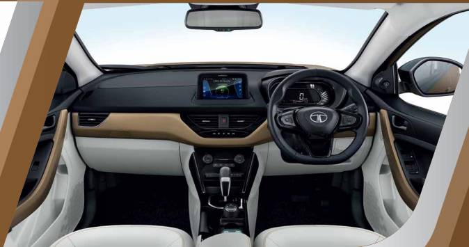
Exquisite Starlight Dashboard

An exquisite combination of earthy bronze body and a platinum silver roof.