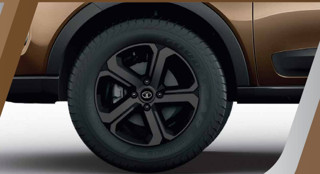
R16 Jet Black Alloys

Pilot your charter in the lap of ultimate luxury with absolute dominance