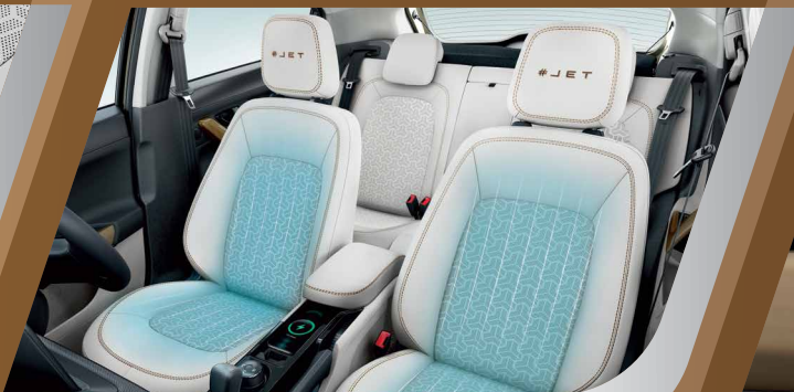
Ventilated Leatherette seats

Premium Oyster White Ventilated Leatherette seats with Bronze Deco Stitch and #JET Embroidery on front Headrests