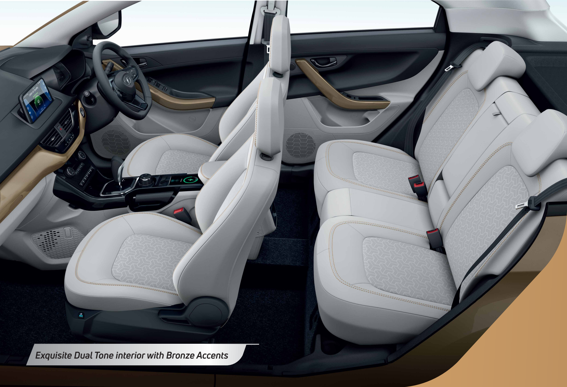
Exquisite Dual Tone interior with Bronze Accents